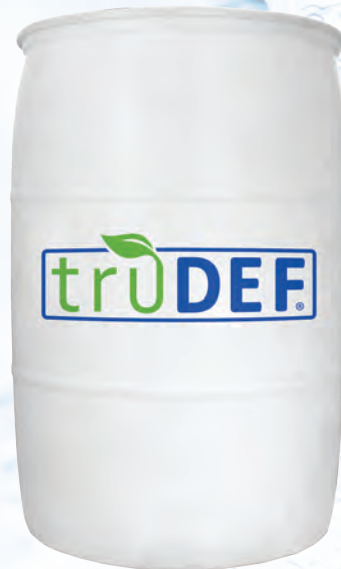
55 GALLON DRUM