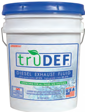
5 GALLON PAIL